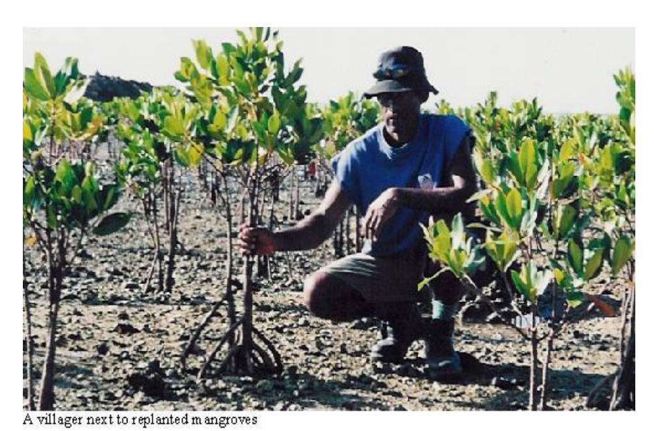
A villager next to replanted mangroves, Yadua

The OISCA, a Japanese non-governmental organization, over the past two years has assisted FSP (Fiji) and the Yadua community with replanting of mangrove seedlings, mainly Rhizophora . Spp , along the foreshore especially in deforested areas. To date over 400 seedlings have been planted, some now reaching up to over a metre tall. A nursery was set up in the same area in order to supply sufficient seedlings to other villages that have requested replanting of mangrove. Yadua villagers have observed crabs and fish species such as mullets now frequenting the new mangrove areas. This has generated more interest in replanting mangroves in neighbouring districts. A second village, Navuevu, has declared their existing mangrove swamps a protected area.