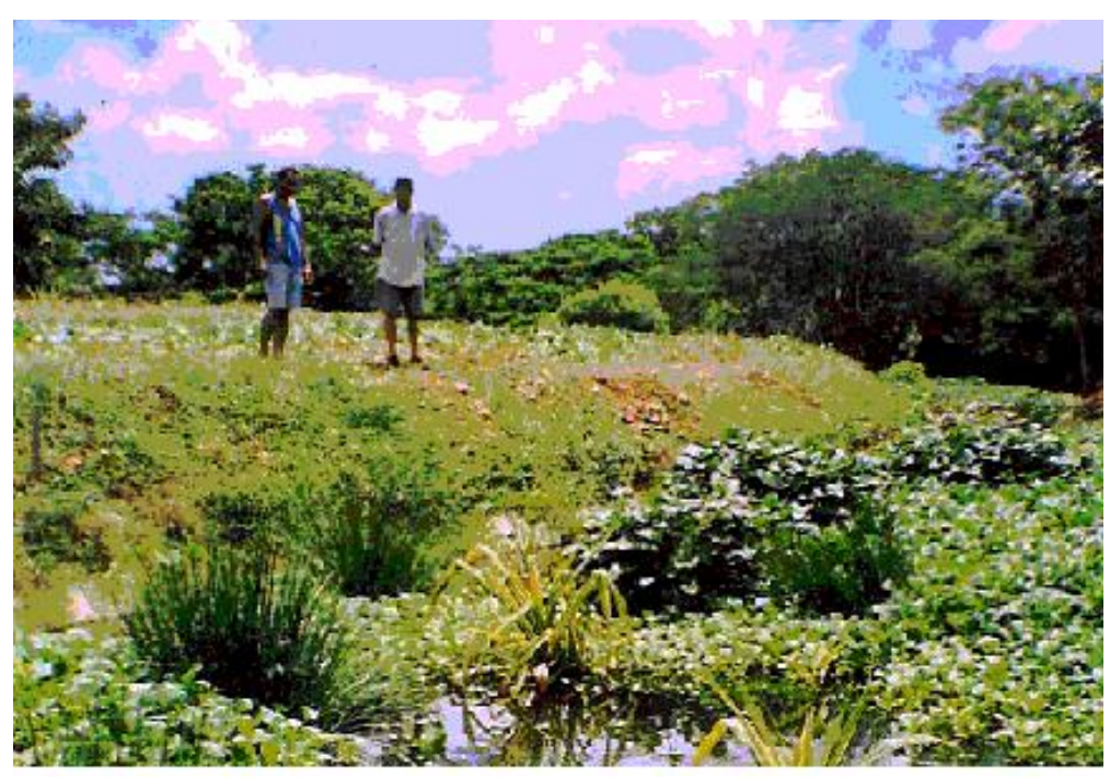
Completed wetland planted with a variety of species