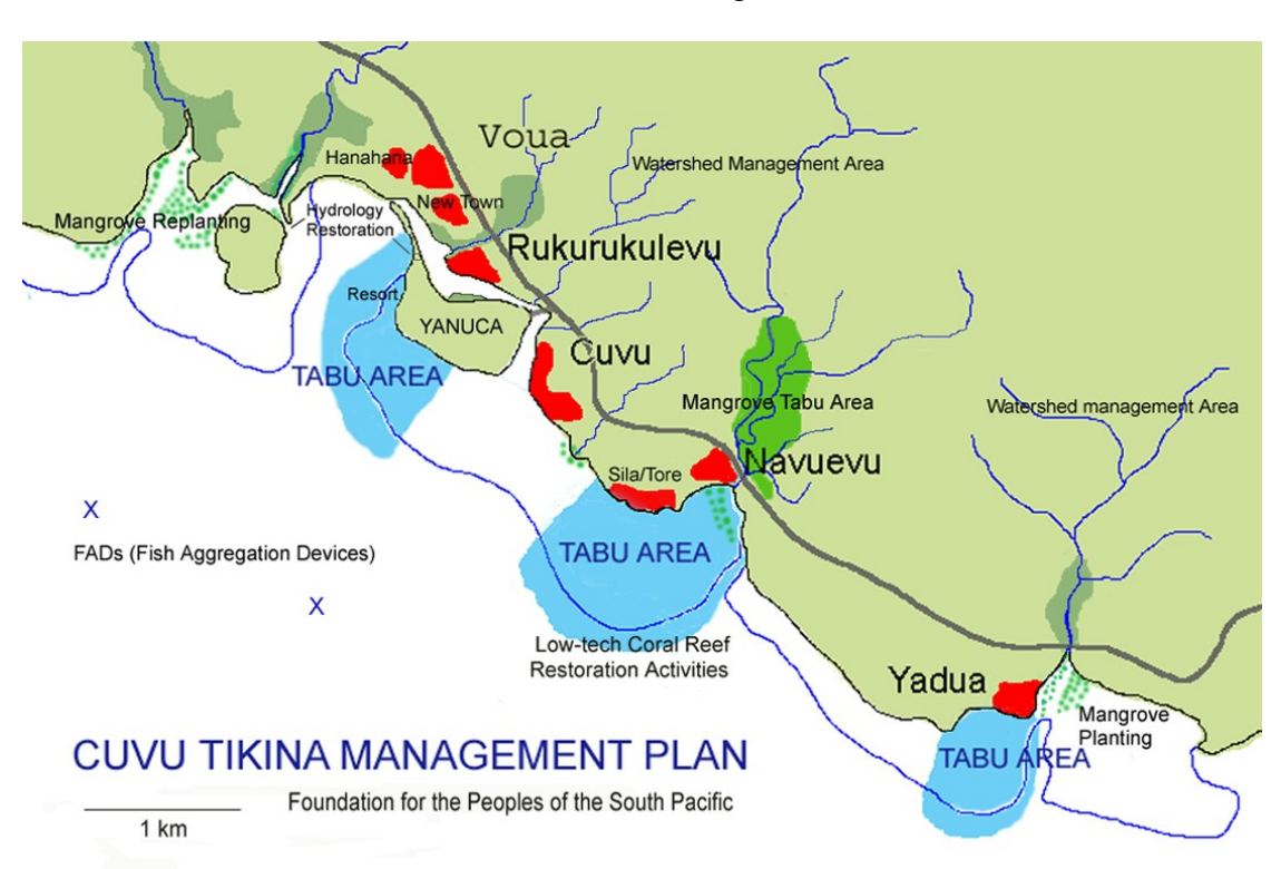
Map1 The Watershed Management Areas

A difficulty experienced with watershed management was the uncertainty of renewal of lease agreements. The majority of occupants in the reaches of the watersheds are cane farmers leasing land from local communities. With the uncertainty of renewal of lease agreements most farmers lacked interest in improving land management practices. As a result of this, a soil conservation site was established. In conjunction with the Department of Agriculture and landowners, Vertiver grass ( Veriveria zizanoides ) was planted in contours along a steep slope in an area of about 3 acres at Yadua. Vertiver forms a dense root network and thick hedges thereby reducing soil erosion and allowing more water to filter through the soil. Commercial crops such as pineapple and sugarcane are planted in between the hedges. This is intended to serve as a demonstration site for other farmers and villagers in the watershed area.