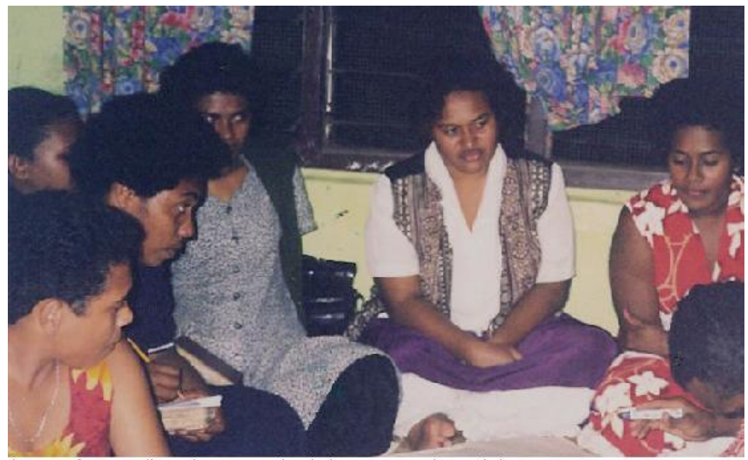
A women's group discussing an exercise during a community work shop